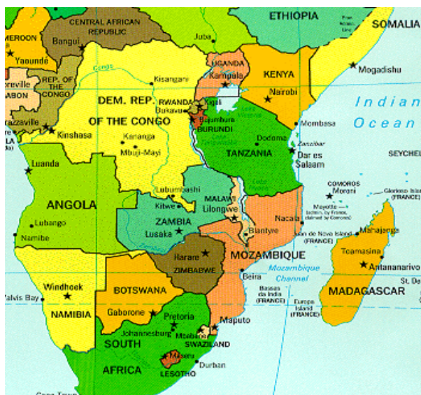
Map of Southern Africa

A land of new opportunities. From a broader perspective, the Southern African region is experiencing positive growth on the back of various macro-economic factors. Below are economic summaries of some of the countries in the region. Zambia for example has registered solid in the past year (GDP growth c7.0% in 2010, marking twelve consecutive years of positive GDP growth averaging 5.1% per annum over the period). The recovery in global trade and strong demand for commodities from India, China and Brazil has supported metal prices (copper).