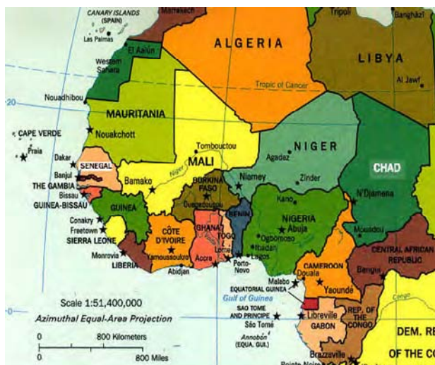
Map of West Africa